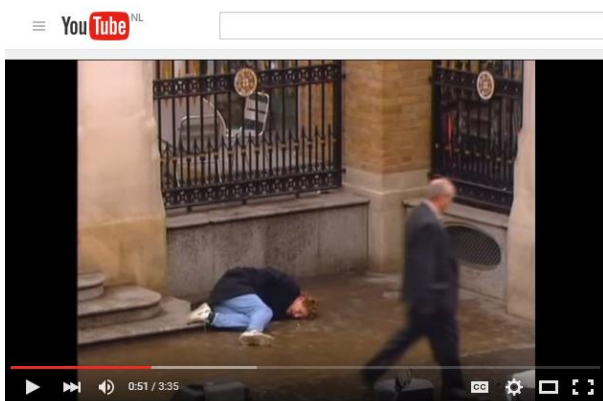
THE BYSTANDER EFFECT

Imagining - Think of a situation where the bystander effect won't occur and how someone can prevent the bystander effect from occurring.